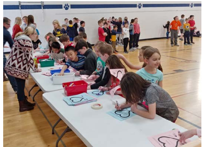
BOYS & GIRLS TRACK & FIELD SIGNUP (GRADES 5-8)